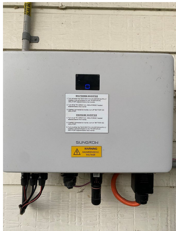
Figure 3: Incorrect shutdown procedure. Missing yellow warning label for PV Disconnectors.

Not all labelling kits include a shutdown procedure label that meets the requirements of the Standard. In many cases, the terminology used on kit-supplied labels does not align with the site-specific shutdown procedure. Regardless of label source, each piece of equipment must be labelled using terminology that precisely matches both the shutdown procedure and the applicable Standard .