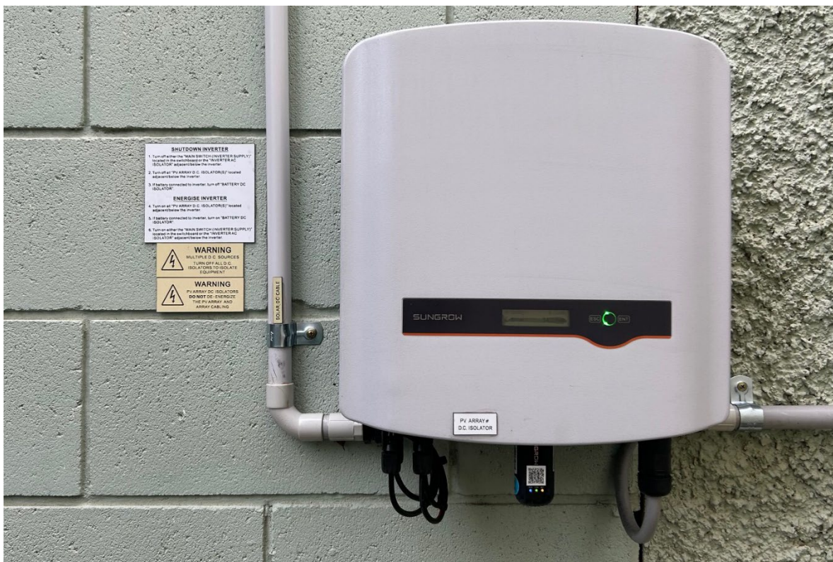
Figure 4: A compliant shutdown procedure is installed adjacent to the PCE.