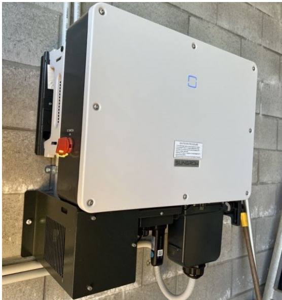
Figure 4: Non-compliant as no sign has been affixed to identify the Integrated PV Array d.c Isolator.