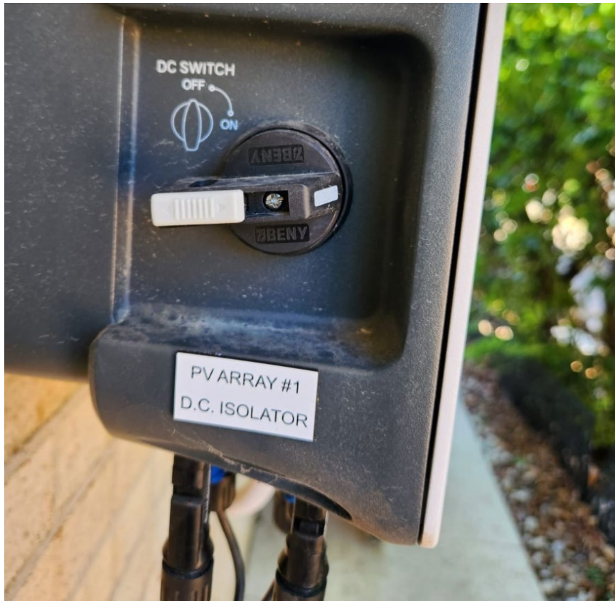
Figure 5: Compliant label has been affixed to identify the d.c Isolator.