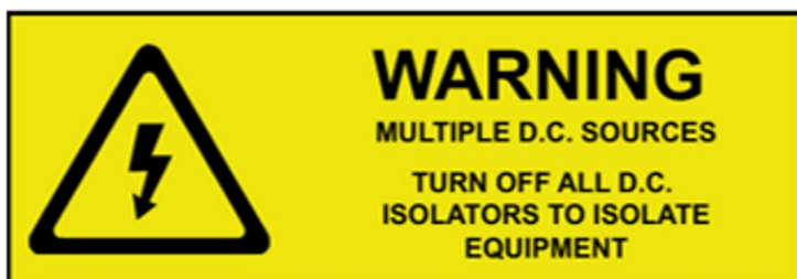
Figure 3: Compliant warning label where multiple isolation/disconnection devices are used that are not ganged.