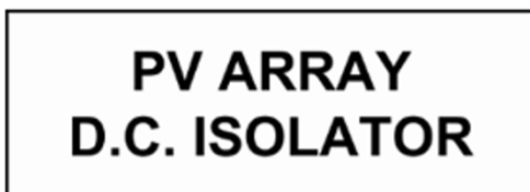
Figure 2: Compliant label for PV Array d.c. isolator.