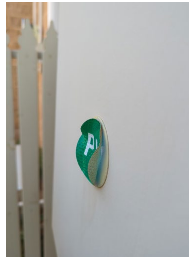
Figure 3: Non-compliant as label not sufficiently durable for the lifetime of the system.