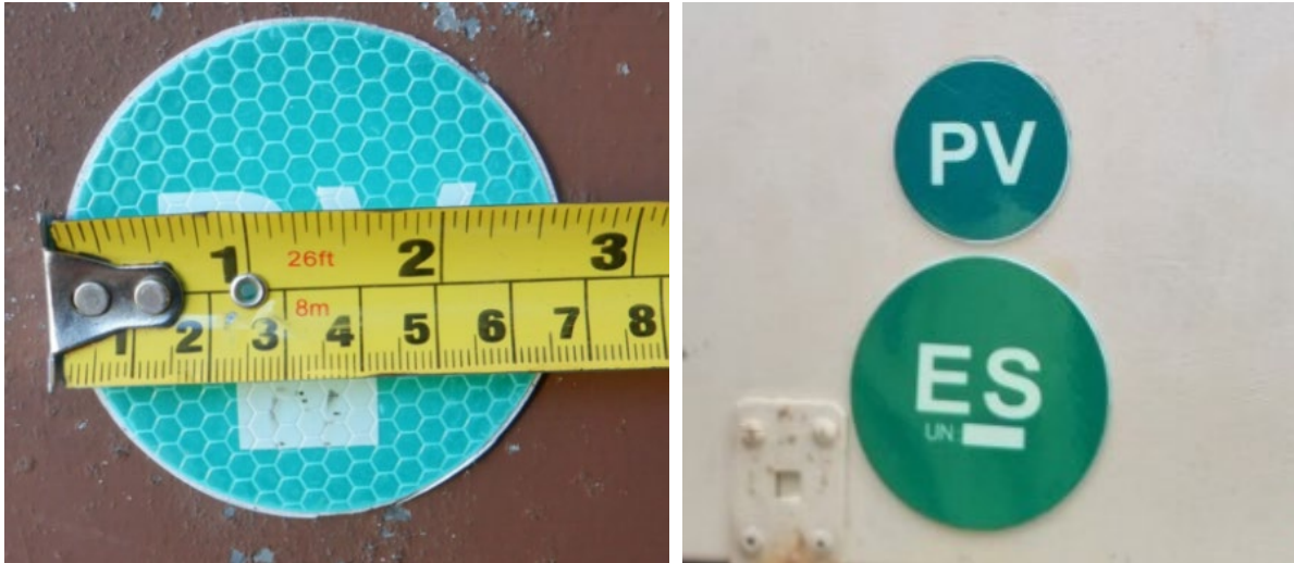
Figure 4: Non-compliant as the label must be at least 100 mm in diameter.