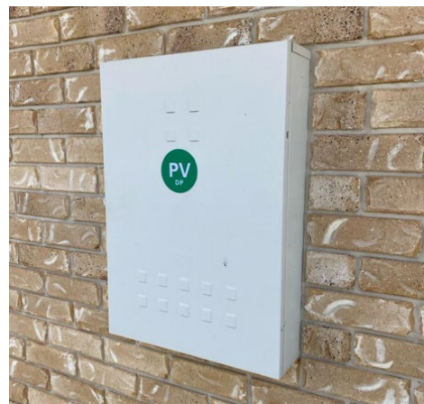
Figure 1: Compliant Fire and emergency information label displaying 'DP' as the method of isolation used at the PV array.

This document outlines the key requirements for correct installation of equipment and includes examples of observed non-compliances to highlight common installation errors and help prevent their recurrence.