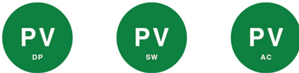
Figure 2: Example of signs for fire and emergency information.